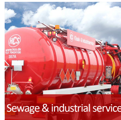
Sewage & industrial service