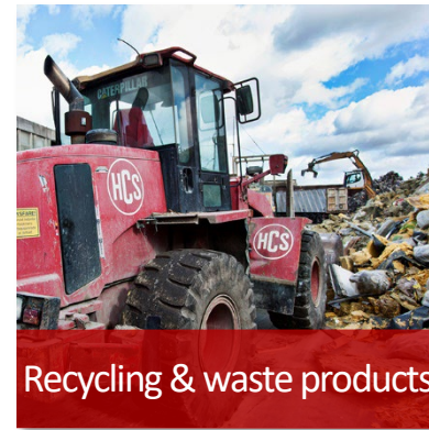
Recycling & waste products